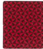
300-001 Deep Crimson