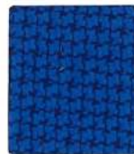
299-024 Blue Ribbon