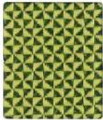
300-003 Spring Green