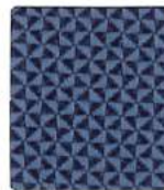
300-004 Midnight Blue