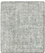
621-046 Light Grey