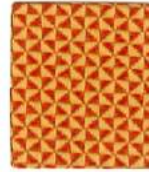
300-019 Golden Orange