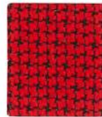
299-021 Red Baron