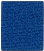
298-014 Blue Ray