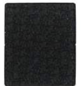
299-006 Slate Black

Additional colors are available. Please refer to the Mayer Fabrics website.